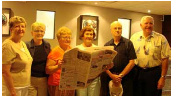
Travelers from Winner catching up on local news with the Winner paper in Winnipeg