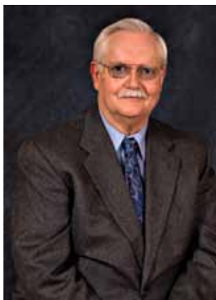
President W. Allen Price

Historical Places! Historical People! By-laws Changes! Great Speakers! Tour of the Capitol! Election of Officers!