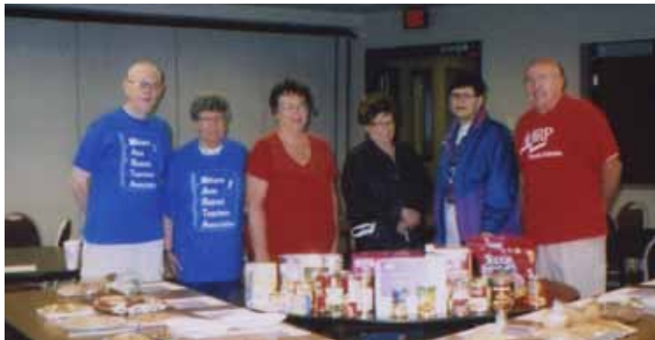
Milbank members gather for one of their monthly meetings

We appreciate having a local member who will do the Tax Aide which will be offered in Philip and to surrounding communities. We had an entry in the Scottie Homecoming Parade.