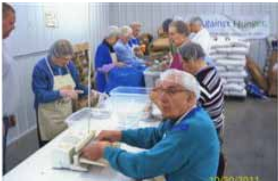
Packing food for the Kids Against Hunger program

OCTOBER 20 • 13 members visited the Orphan Grain Train Building/packed food for the program –Kids Against Hunger. 1572 meals were packed. Over $200 in donations by members were given to the project. RTA brought in 25 pounds of food-given to local pantry.